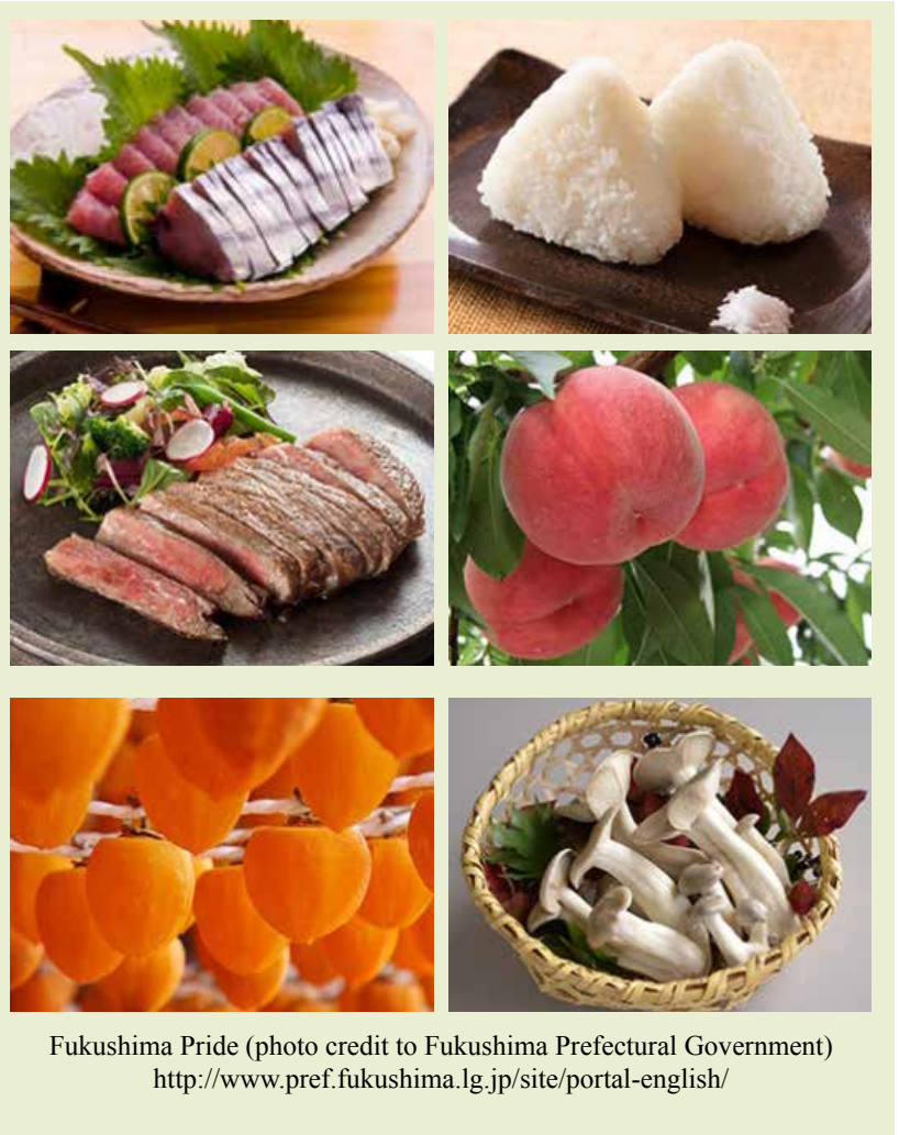
Fukushima Pride (photo credit to Fukushima Prefectural Government) http://www.pref.fukushima.lg.jp/site/portal-english/

(Source: Reconstruction Agency: Status of Reconstruction from the Great East Japan Earthquake and Reconstruction Efforts, September 2020)