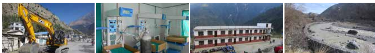
(Projects implemented in the past)

The “Grant Assistance for Japanese NGO Projects” is a scheme in which Government of Japan provides funds for economic and social development projects by working with NGOs. It is a core scheme to proceed with partnerships between the Government of Japan and Japanese NGOs.