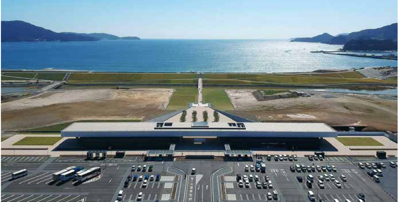
Iwate Tsunami Memorial Museum

have been recovering from difficulties caused by the earthquake and are trying to create a “new Fukushima.” They wish to invite you to learn more about the towns and cities in this region, and hope you will enjoy learning of the region’s rich natural environment and delicious food products. It should be noted, Japan has the most strict standards in the world regarding radioactive substances in food. Despite the nuclear power plant accident caused by the earthquake, the safety of Japanese food products is guaranteed, as its quality and taste.