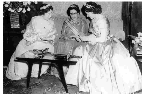
Queen Ratna chatting with Japanese Empress and Princess (April 1960)