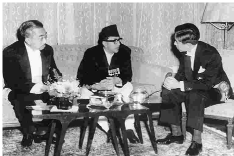
King Mahendra meeting with Emperor Hirohito together with Crown Prince Akihito (April 1960)

Birendra (the then Crown Prince) spent a couple of months as a special student in Tokyo University in 1967. The visit created a good opportunity to develop a close personal friendship with the imperial family of Japan. The imperial couple of Japan revisited Nepal in 1975 to attend the coronation of His Majesty King Birendra. In subsequent years, visits by the members of the imperial family of Japan and royal family of Nepal have taken place from time to time.